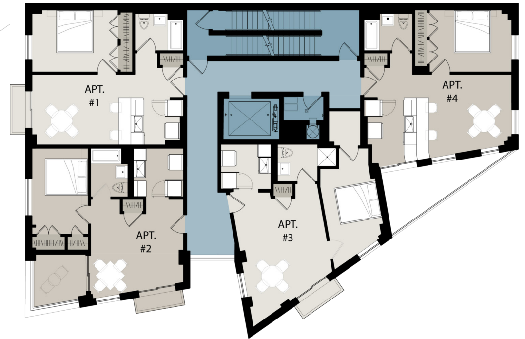
TYPICAL FLOOR 2