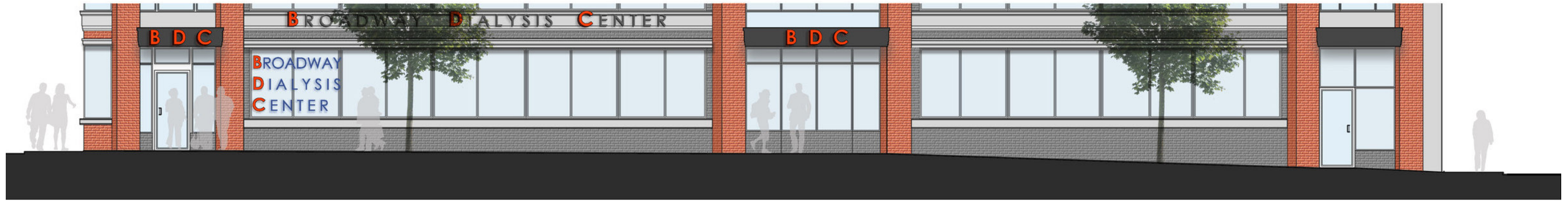
BROADWAY DIALYSIS CENTER - BROADWAY ELEVATION